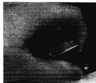
To loosen or release straps: Lift up ONLY the inner lever and pull the black strap out of buckle.

You may need to loosen the straps a little when sitting to make it more comfortable and remember to tighten the straps when standing up.